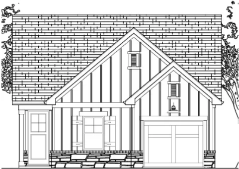
The Brooke 1154 Square Feet -2 BR/2 BA